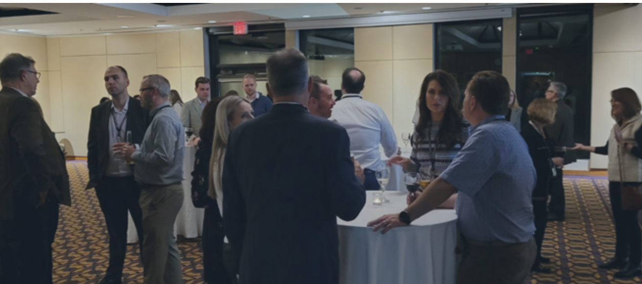
Cocktail and Social at the Kingbridge Conference Centre during FEA Forum near Toronto, Ontario

In Quebec, our collaboration with Espace ORIA has been instrumental in delivering custom family enterprise advisor education, focusing on “Business Family Dynamics.” This partnership is dedicated to empowering Francophone professionals and enriching the advisory capabilities within Quebec’s vibrant entrepreneurial community.