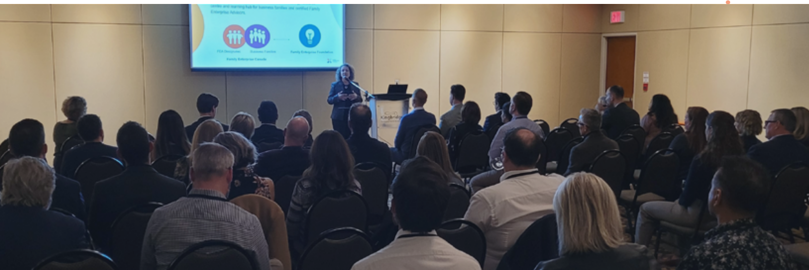
Announcements during FEA Forum near Toronto, Ontario