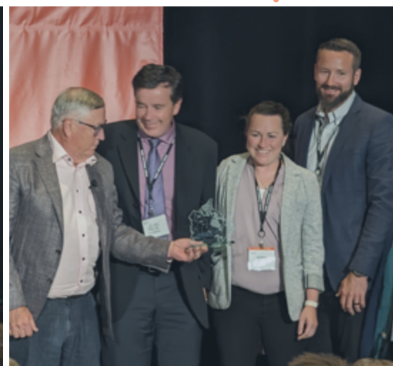
The Price Family