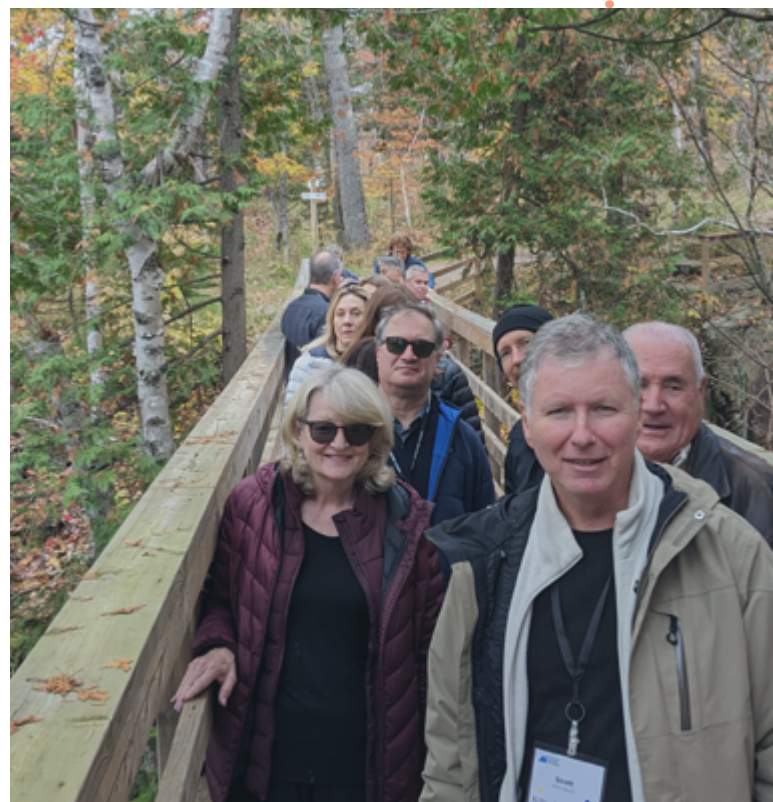
"Walkshop" up Mont Tremblant, Québec at Families Summit of Minds

Canada's family enterprises continue to profoundly impact the Canadian economy, contributing $574.6 billion to the country's GDP and providing millions with employment. This year, we've enhanced our advocacy and educational efforts to support these vital contributions, ensuring that family businesses remain a cornerstone of national prosperity.