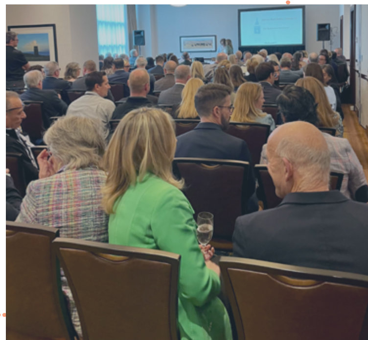
FEA Concurrent Session at Symposium 2024

The Family Business Symposium, a key event in our calendar, was held in Calgary from May 27 to 29. This year's theme was Impact which resonated with hundreds of Canada's family business leaders who attended. The Symposium delved into crucial post-pandemic transition strategies, the importance of mental health and resilience, the role of digital transformation in business sustainability and the complexities of navigating family dynamics in succession planning.